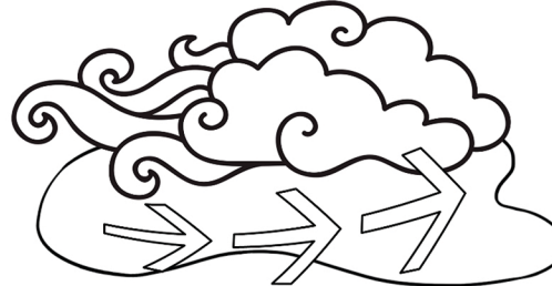
Air & Ocean Currents